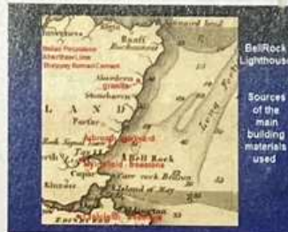
Fig.1 Map showing the lighthouse and its building materials sources