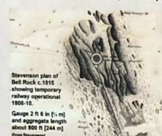
Fig.7 Stevenson plan showing the extent of the temporary railway