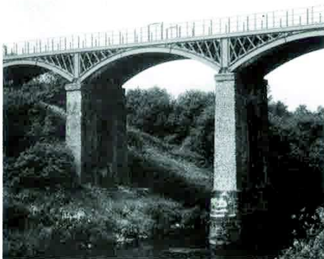
Outwood Viaduct

After renovation, Outwood Viaduct (HEW 2087) was formally opened as a footpath, bridleway and cycleway on Friday 26 June 1999 by Sir William McAlpine, President of the Railway Heritage Trust. It had fallen into dereliction since the railway closed in 1966, but its proposed demolition by British Rail was forestalled by public objection led by the Trust and it was given Grade II listed status.