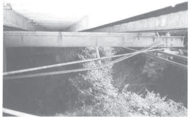
Normansville Bridge, under the deck

exhibition area. It was originally erected across the enlarged Erie Canal at Sprakers in 1869.