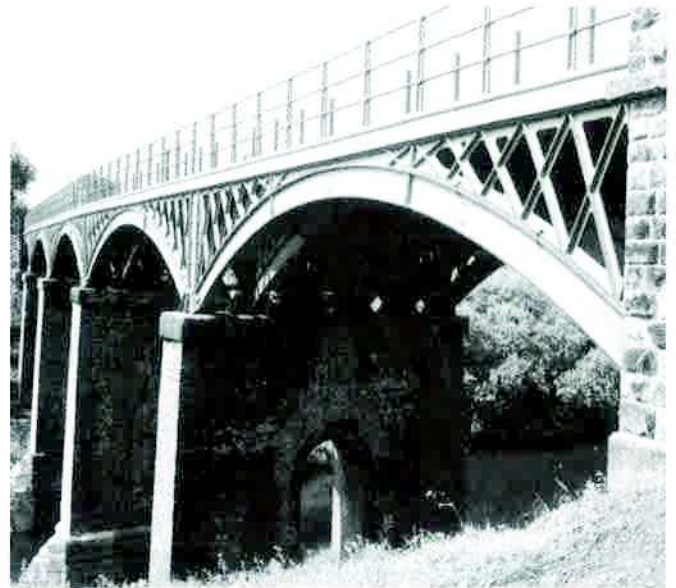
Outwood Viaduct