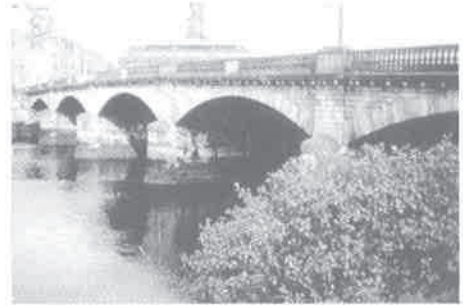
Victoria Bridge - 1854, Glasgow's oldest surviving complete Clyde Bridge

separate schools programme will introduce a new generation to civil engineering as children in primary schools in West Scotland are given the chance to construct a scaled down bridge.