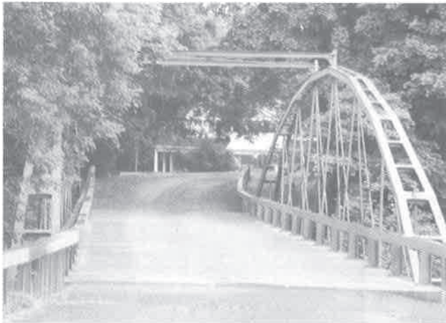
Normansville Bridge, Albany USA (1867, c.1900)

The Whipple bowstring truss, invented and patented in 1841 by 'the father of iron bridges in America', Squire Whipple (1804-1888), essentially used cast iron for the deck beams and arch member and wrought iron for the links, ties and braces. It was ingeniously designed, economical, and easy to erect. Several hundred of these bridges were erected during the second half of the nineteenth century, mainly in New York State. Very few now survive and none of the three visited were at their original sites.