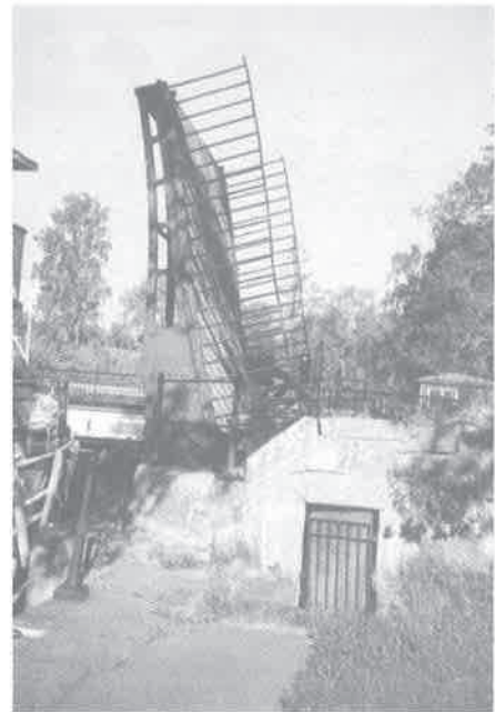
Göta Canal - Forsvite cast iron lifting bridge