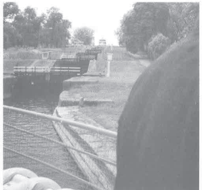
Göta Canal - Berg flight of seven locks. Boat at top 'Wilhelm Thom'

After crossing Lake Vättern we came to the Göta canal's oldest lock built in 1813 and a cast iron lifting bridge of the same date at Forsvite and so into Lake