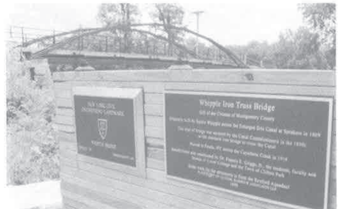
Erie Canal Bridge, Forts Ferry