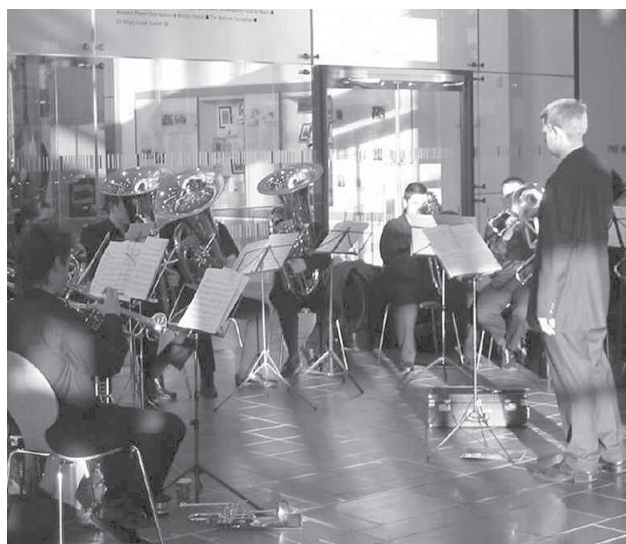
Continuing a Brunellian Tradition

The exhibition which is located in the foyer of the museum shows examples of Brunel's work and is open until 25 June after which it will be toured around other museums and exhibition sites in South Wales.