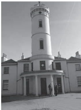
The Signal Tower Museum, Arbroath. Completed in 1813 as the Bell Rock Lighthouse Shore Station