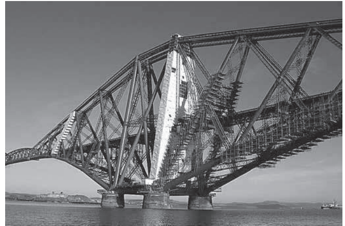
Forth Bridge Restoration

A decade-long repair and repainting project on the 123 year-old bridge concluded in December 2011; the client was Network Rail, consultant Pell Frischmann, and contractor Balfour Beatty. The restoration works featured innovative scaffolding and encapsulation techniques, replacement of corroded steel, and the application of a high-tech three coat protective system, finished off in the bridge's signature red oxide colour. Materials handling was a major link in the logistics chain, supported by road / rail vehicles capable of towing and unloading rail wagons. Extensive trialling established that a combination of traditional tube-and-fitting scaffolding, supplemented with "system scaffolding" at specific locations, provided the best option and ensured repeatability of major scaffold layouts. Pads and support points, welded to the bridge steelwork, formed the "foundations" of most of the scaffolds, which were then built up, constructed from the top down, or suspended from steel wire ropes. The opaque white encapsulation units which were attached to the scaffolds, and which became a land mark feature of the project, permitted the steel repairs, blast-cleaning and painting to be carried out within a climatically-controlled environment.