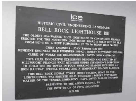
Close-up of plaque erected at Museum in February 2013