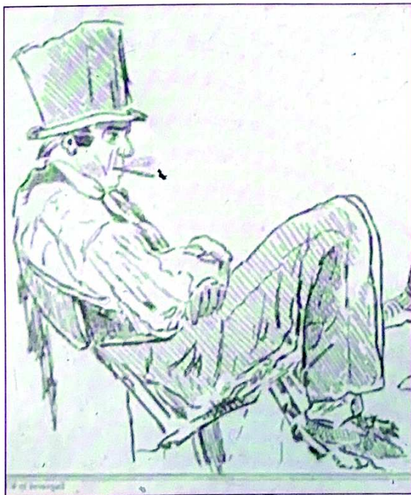
"The American Professional 1828. Any resemblance is entirely coincidental."

We are, of course, looking forward to welcoming a senior group from the ASCE to Scotland in June.