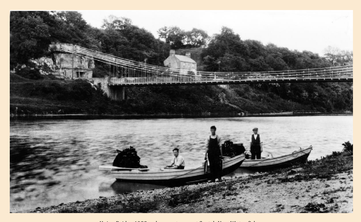
Union Bridge 1933; salmon netsmen at Scotch New Water fishery