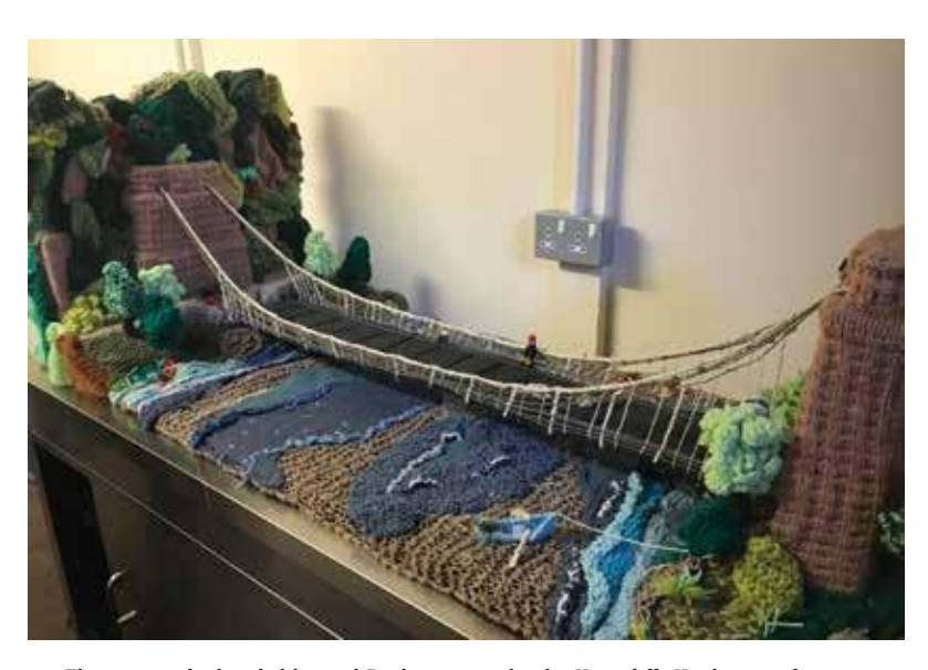
The intricately detailed knitted Bridge project by the Horncliffe Hookers craft group

Another key component of the project will see the development of a comprehensive online interpretive offer which will act as an overarching vehicle for visitors to access information both on-site and from remote locations. The digital offer will allow the many stories, strands and depths of information to be better explained,